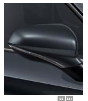
MAGNETIC TECH S7S7 - Metallic