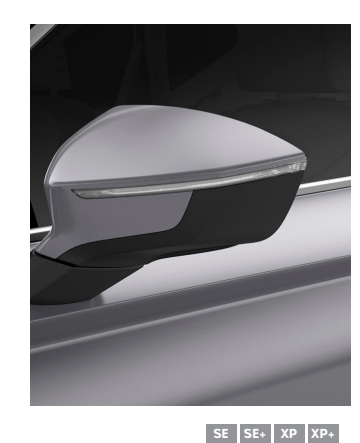
Brilliant Silver 8E8E- Metallic