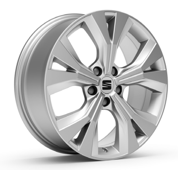
PERFORMANCE 18" ALLOY WHEELS XP