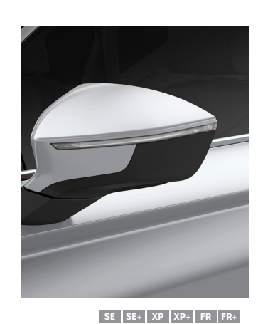
Nevada White 2Y2Y - Metallic