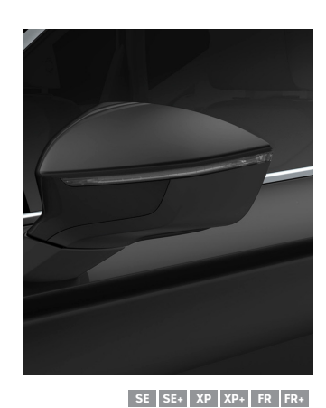
Magic Black 1Z1Z - Metallic