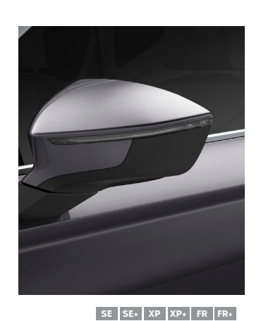
Graphite Grey 5X5X - Metallic