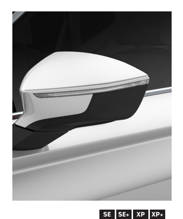
Bila White 9P9P - Soft