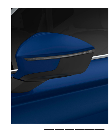
SE SE+ XP XP+ FR FR+ Energy Blue K4K4 - Soft