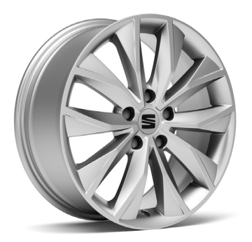
DYNAMIC 17" ALLOY WHEELS SE