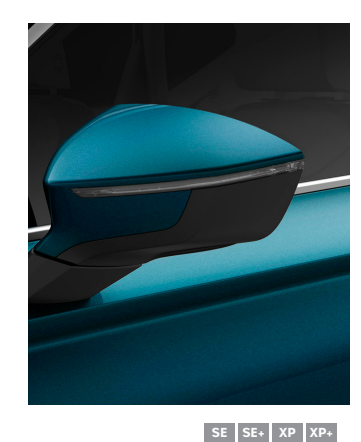
Lava Blue * OFOF - Metallic