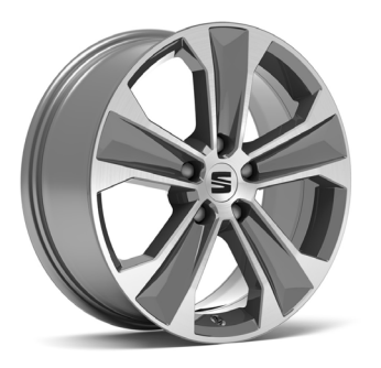
DYNAMIC 17" ALLOY WHEELS SE+