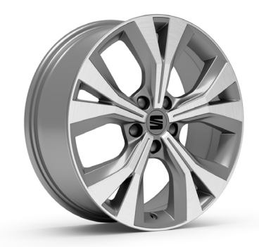
PERFORMANCE 18" ALLOY WHEELS XP+