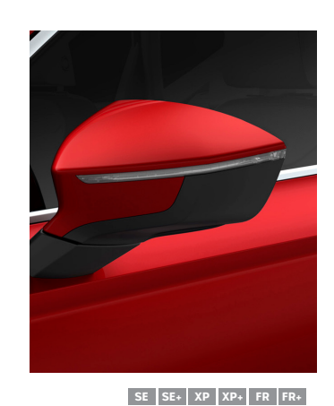
Velvet Red K1K1 - Premium Metallic